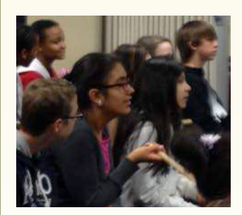
African American History Challenge 2014 National Champions